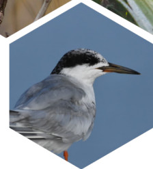
Clockwise from top: Purple Gallinule ; Barred Owl ; Painted Bunting ; Common Tern ; Bald Eagle ; Sedge Wren